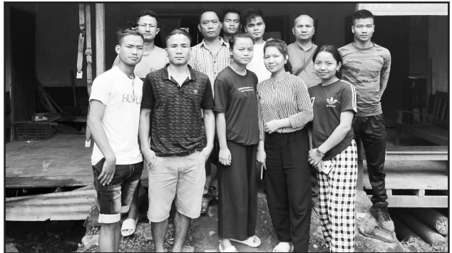
Presbytery Level Solfa Training Singngat, ZTP