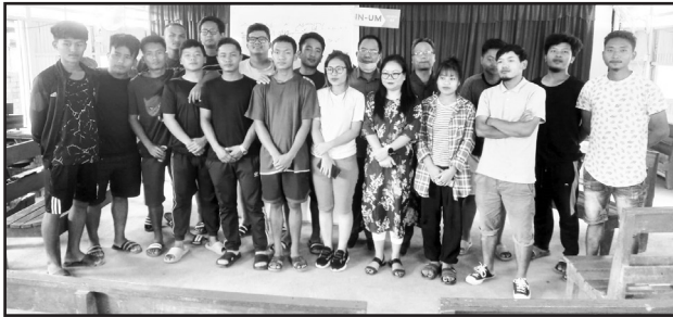
Presbytery Level Solfa Training Awnchinkap Khuo, MGP

(Note: A sources/ Referenences te khu nivei thumvei kigel koikoi ahiziehin kang tanglang thei sih a, simtuten nang ngaisiem ding un kang ngen hi).